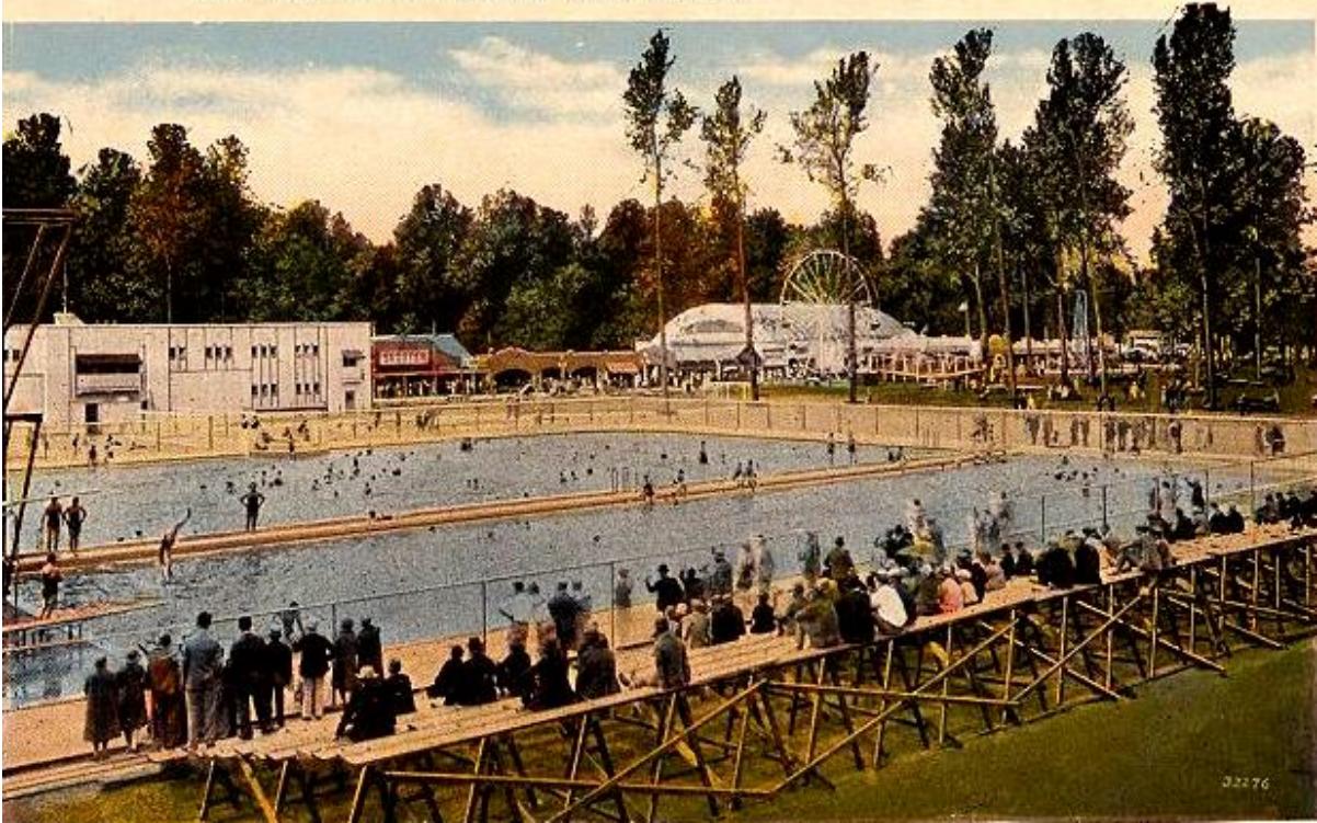
This view of the swimming pool, at its original location, was seen from the railroad bridge, on the Northwest edge of the Park. Behind the swimming pool, you can see the Bathhouse, the Skooters, the Midway, the Golden-Canopied Dance Pavilion and the Ferris Wheel. In the 1930s the swimming pools were moved a little further to the south and to the east. Jantzen Beach had the first Musical Swimming Pool. You could swim and enjoy music underwater.