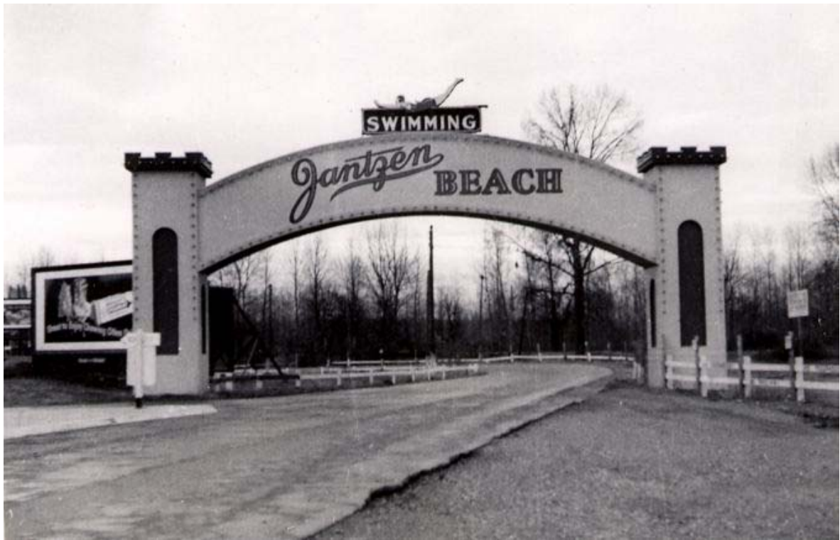
Entrance to Jantzen Beach Park

Jantzen Beach Amusement Park was heralded as Portland's Million Dollar Playground. When it opened on May 26, 1928, Jantzen Beach was the largest amusement park in the nation. The park sprawled over 123 acres at Hayden Island at the northern tip of Portland.