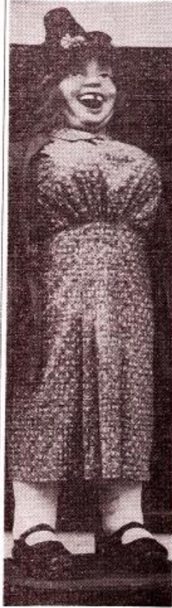
"LAFFING SAL" She'll direct Jantzeners.

As this article from The Oregonian from May 2, 1941 says, Jantzen Beach installed two robot circus criers, "Laffing Sal" and "Joe Barker" to direct Patrons as they entered the Park.