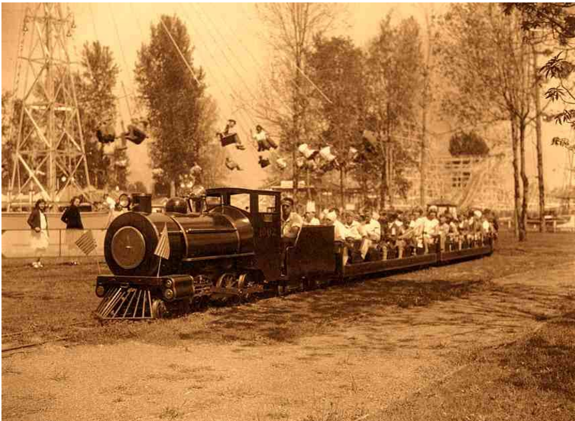
The Jantzen Beach Railway with the Big Dipper and the Merry Mix-up in the background

Jantzen Beach survived the Vanport flood in 1948, but the people who survived moved away. The loss of people in the immediate vicinity led to the loss of patrons to the park and attendance never did reach pre-flood levels.