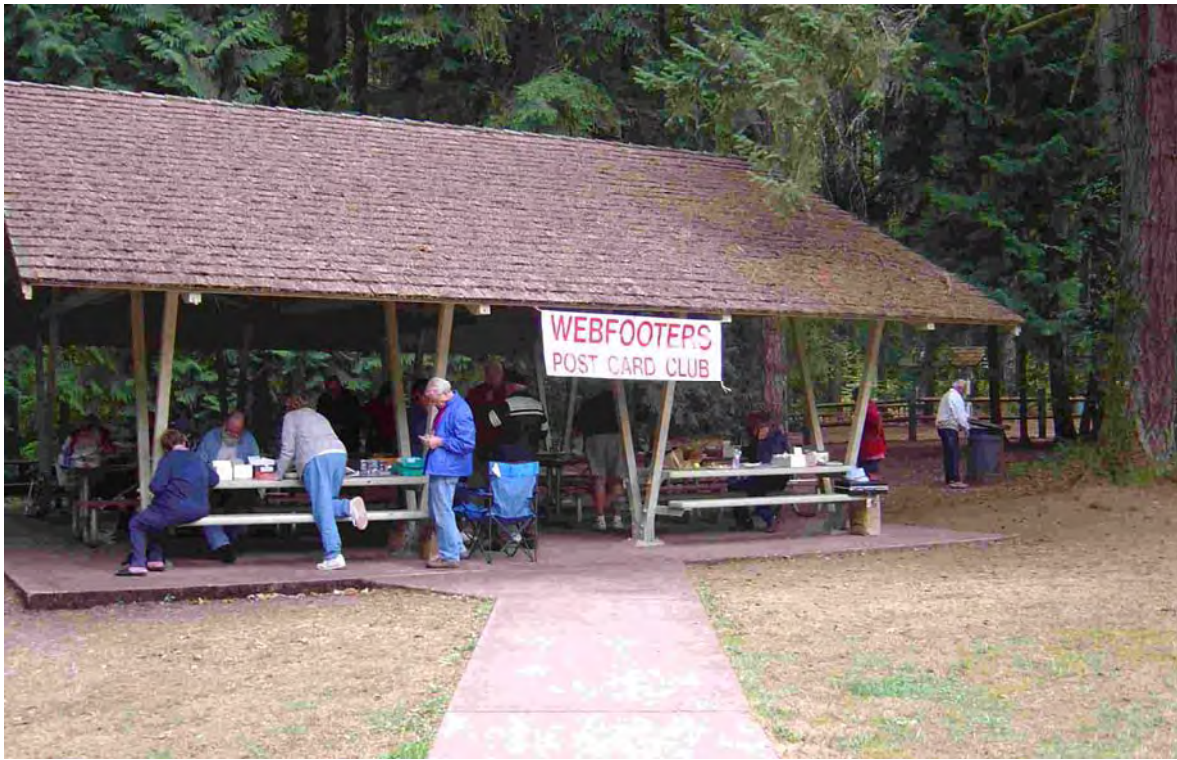
Webfooters enjoy visiting and looking for cards at our picnic at Roslyn Lake Park