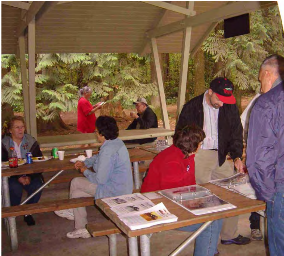
Webfooters visit and view historical photos and cards