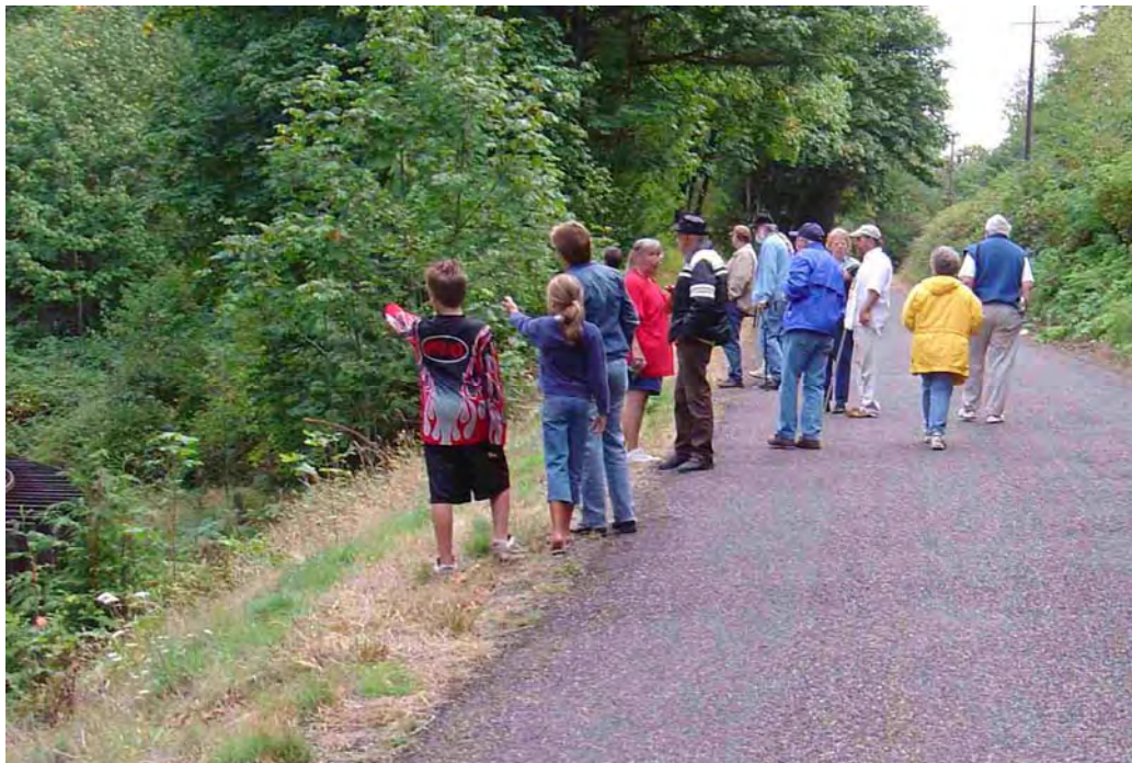
Webfooters view the Wooden Water Flume