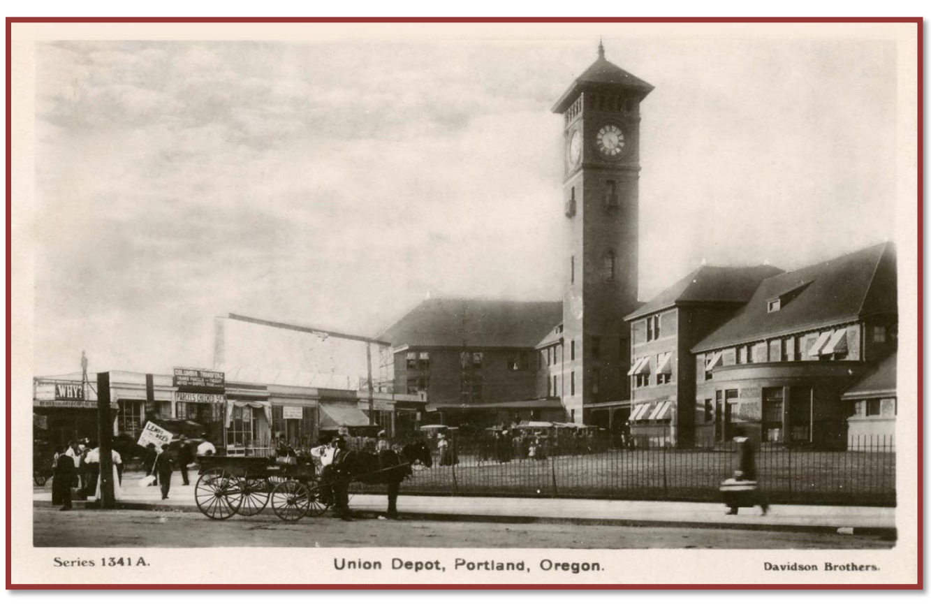
Union Depot circa 1909.