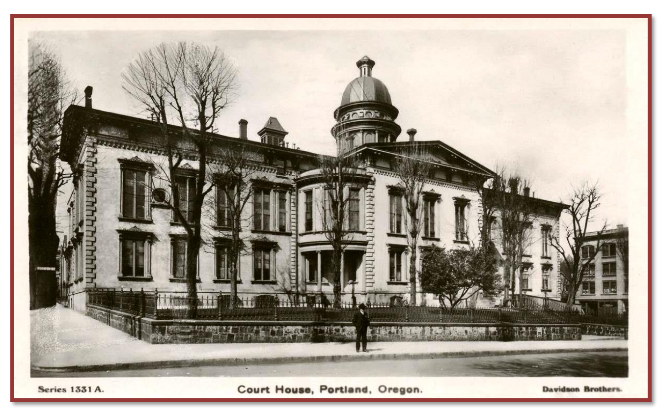
The original Multnomah County Courthouse at SW Fourth & Fifth Avenue and Main & Salmon Streets, circa 1909.