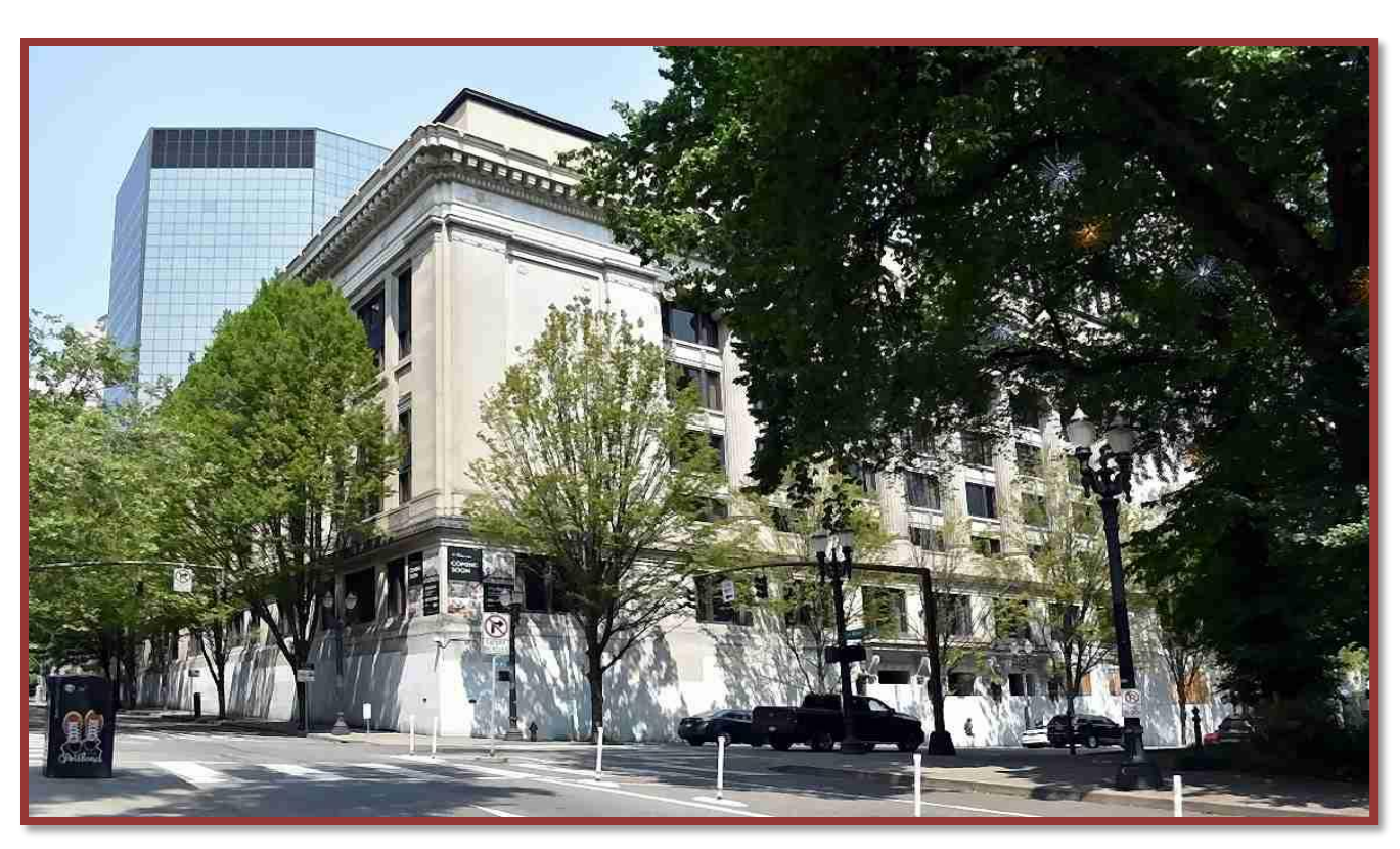
Multnomah County Courthouse as it stands today. Photo taken in 2023. Photo.