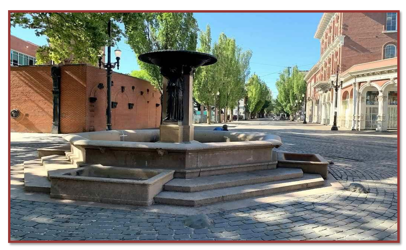
Today, a portion of SW First Avenue by and near the fountain is only open for use for MAX trains. Don Nelson Photo 8-3-2023.