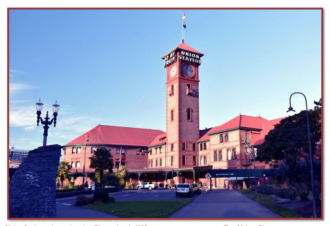
Union Station as it stands today. Photo taken in 2022.

Although known as Grand Central Station and Union Depot in earlier years, Portland's train depot at NW Sixth Avenue, Irving Street & Broadway, designed by Architects Van Brunt & Howe, is also known as Union Station and was completed in 1896. Small shops were opposite the depot before 1910. Horse drawn carriages from hotels were parked outside of the depot to transport patrons to their respective hotels. Neon signs were installed on the depot tower above the clock in the late 1940s. The signs spell out "Go By Train" and "Union Station". The area of the parking lot at the Union Station has been reconfigured many times over the years. Union Station is on the National Register of Historic Places.