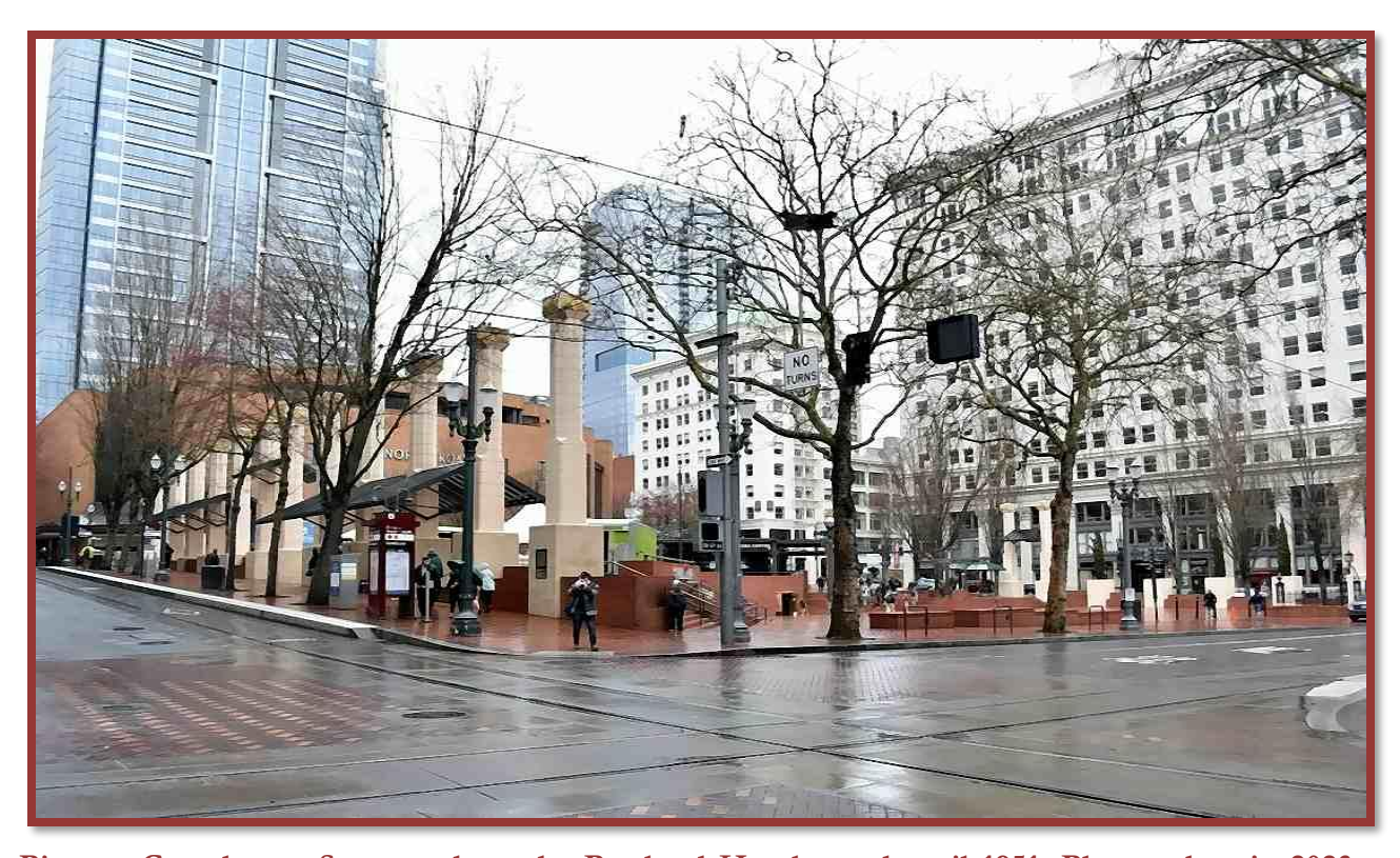
Pioneer Courthouse Square where the Portland Hotel stood until 1951. Photo taken in 2023.