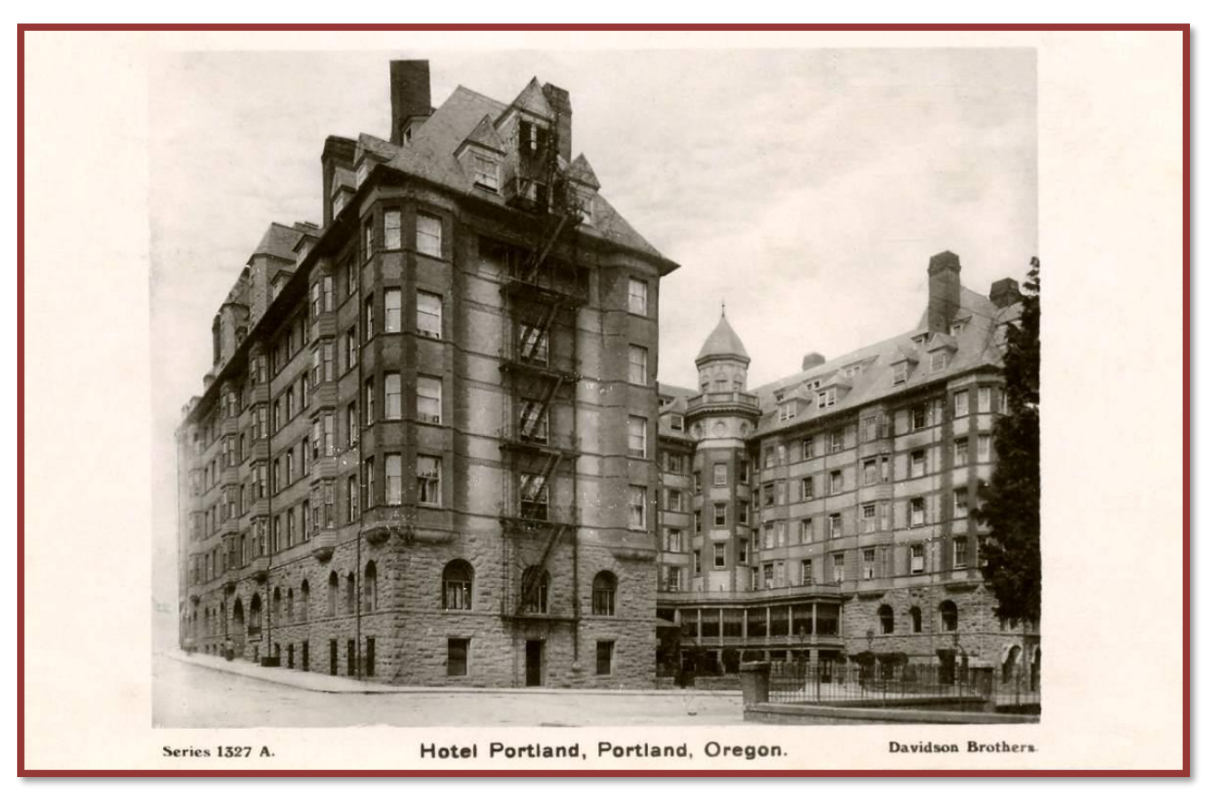
The Hotel Portland, at SW Sixth Avenue & Broadway, Yamhill & Morrison Streets, circa 1909.