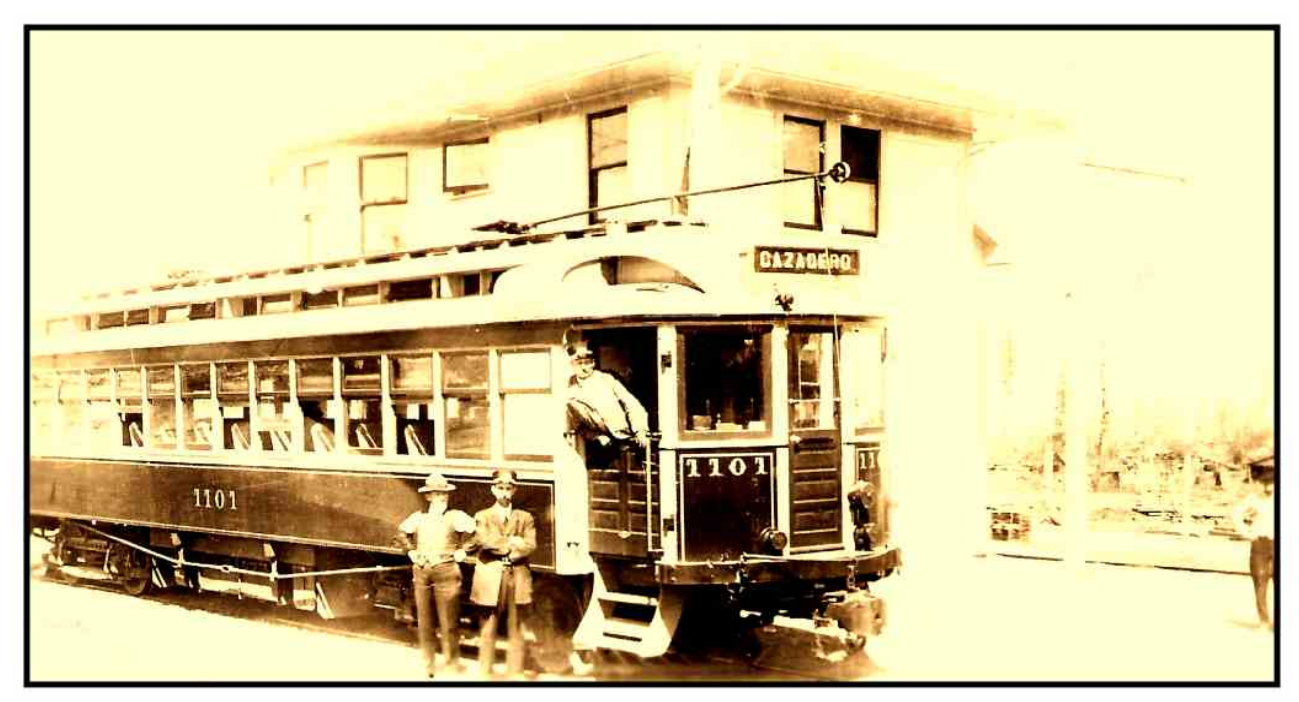
A Portland-bound interurban stopped at the depot in Boring.

Boring began to take shape. In a very short time there appeared: a hotel, a post office, a depot, a general store, two livery stables, a confectionery, and other shops common to most small towns. There also was a saloon and a dance hall. Boring had three different depots over the years. The two-story building shown above and below burned in 1928 and a single-story building was built in its place.