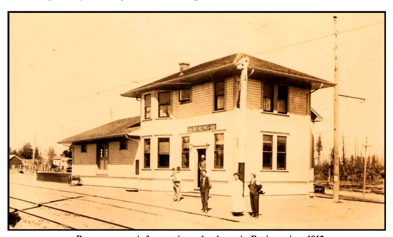
Passengers wait for a train at the depot in Boring, circa 1915.

Boring began to take shape. In a very short time there appeared: a hotel, a post office, a depot, a general store, two livery stables, a confectionery, and other shops common to most small towns. There also was a saloon and a dance hall. Boring had three different depots over the years. The two-story building shown above and below burned in 1928 and a single-story building was built in its place.