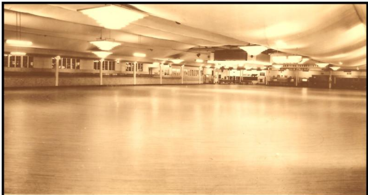
OAKS PARK ROLLER RINK 1948 Pacific Coast Regional Championships