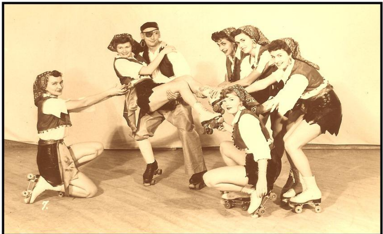
Another view from “Swingin’ in Rhythm” from 1952.