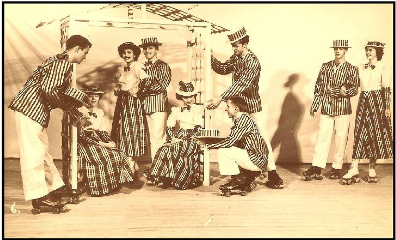
In the 1950s, elaborate musical productions were held at the Oaks Rink including this scene from “Swingin’ in Rhythm” from 1952.