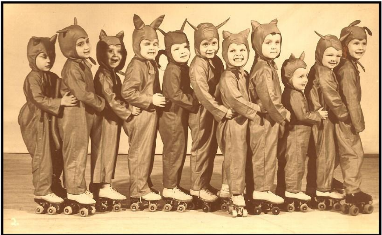
More young skaters performed in “Swingin’ in Rhythm” in 1952.