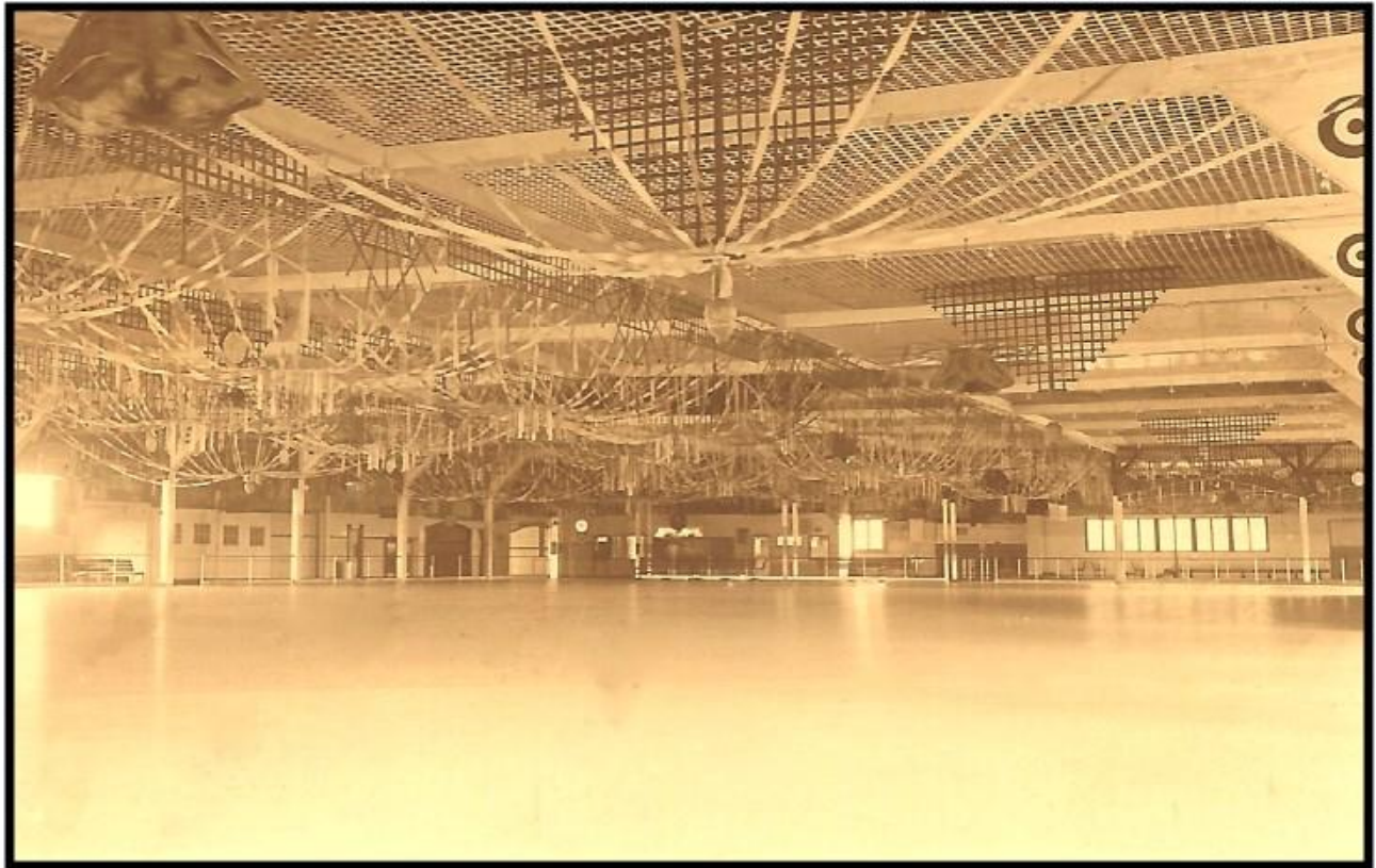
Interior view of the Oaks Skating Rink, circa 1930.