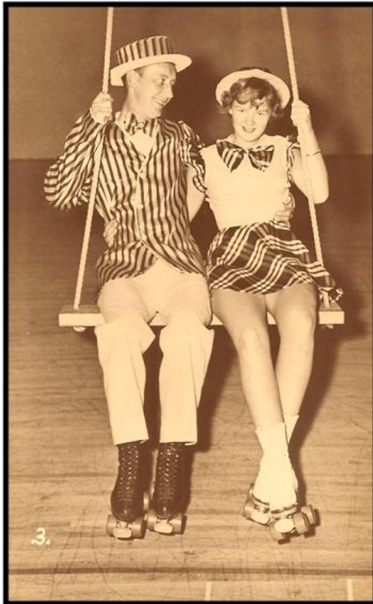
Another young couple performs in “Swingin’ in Rhythm.”

Over the years, Oaks Park Skating Rink was referred to as the “West’s Largest Rink” and the “Largest Roller Skating Rink in the Northwest.” It is also referred to as one of the oldest skating rinks west of the Mississippi. At times, they promoted the Oaks Rink as having four skating floors: the main floor, a beginner’s floor, a “sensational Wave” section and an area for speed skaters. Being located next to the Willamette River, the Oaks Rink has been flooded at least three times. To minimize damage to the hardwood floor, they developed a unique way of floating the floor when the water rises.