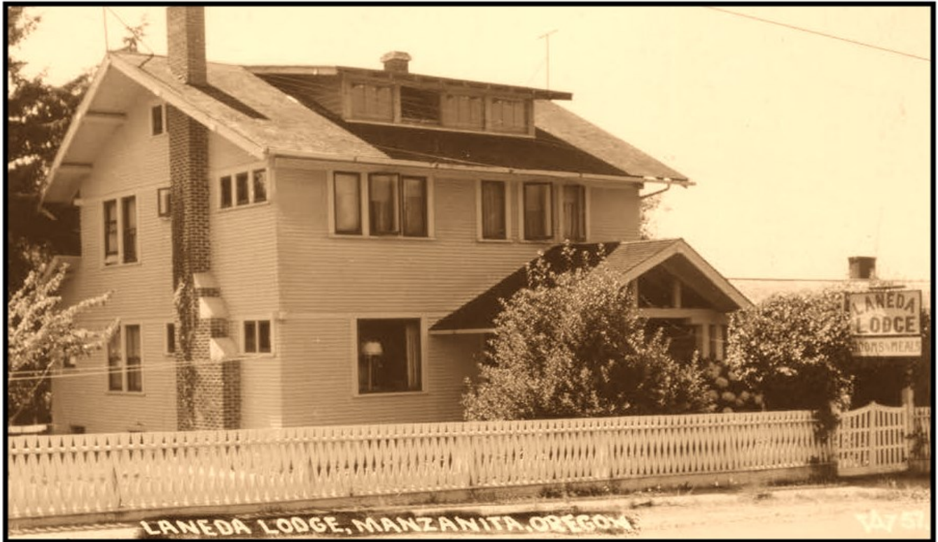
By 1915, Manzanita offered two hotels in addition to tent camping. This building, which housed Laneda Lodge and before that, the Lane Hotel, still stands on Laneda Avenue and it is currently used as a restaurant.