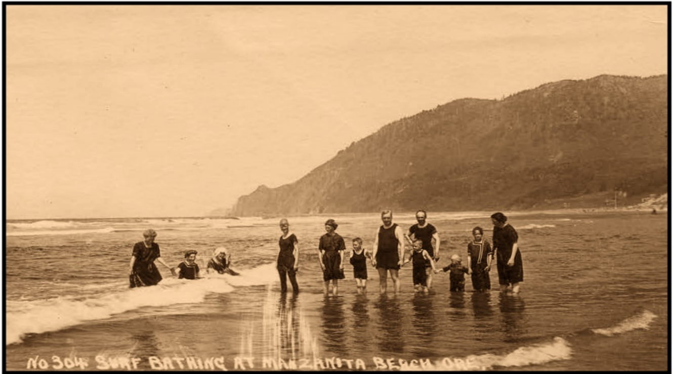
Brochures published by the railroad featured scenes of happy tourists on the beach in the backdrop of Neah-Kah-Nie Mountain like this Patton postcard view.