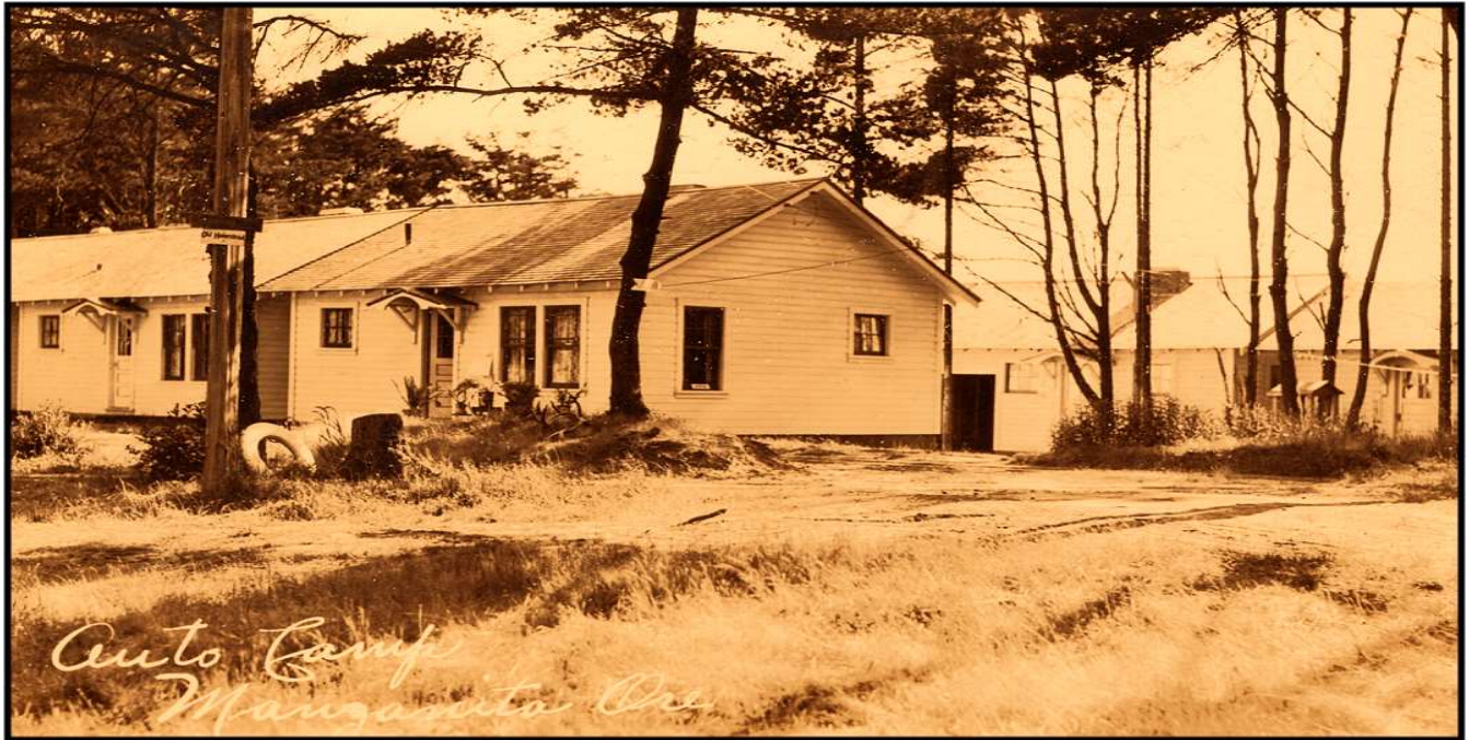
Auto camps featured spacious cabins with electric lights, water and firewood. Wood postcard view from the Mark Moore collection.