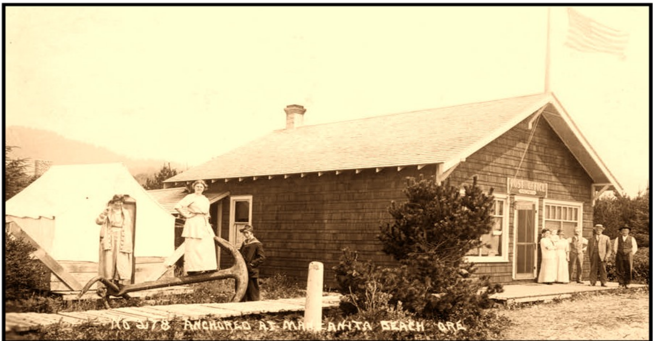
Patton postcard view of the Post Office at Manzanita, Oregon.