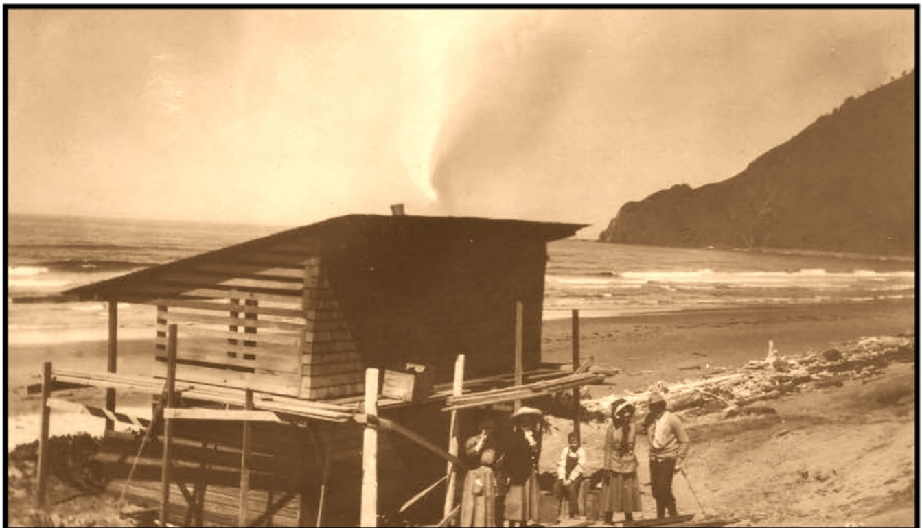
Shelters on the beach allowed visitors to change into proper bathing apparel. For women that meant woolen dresses. The Lanes built this robing house to accommodate people at summer programs of The Oregon Conservatory of Music.