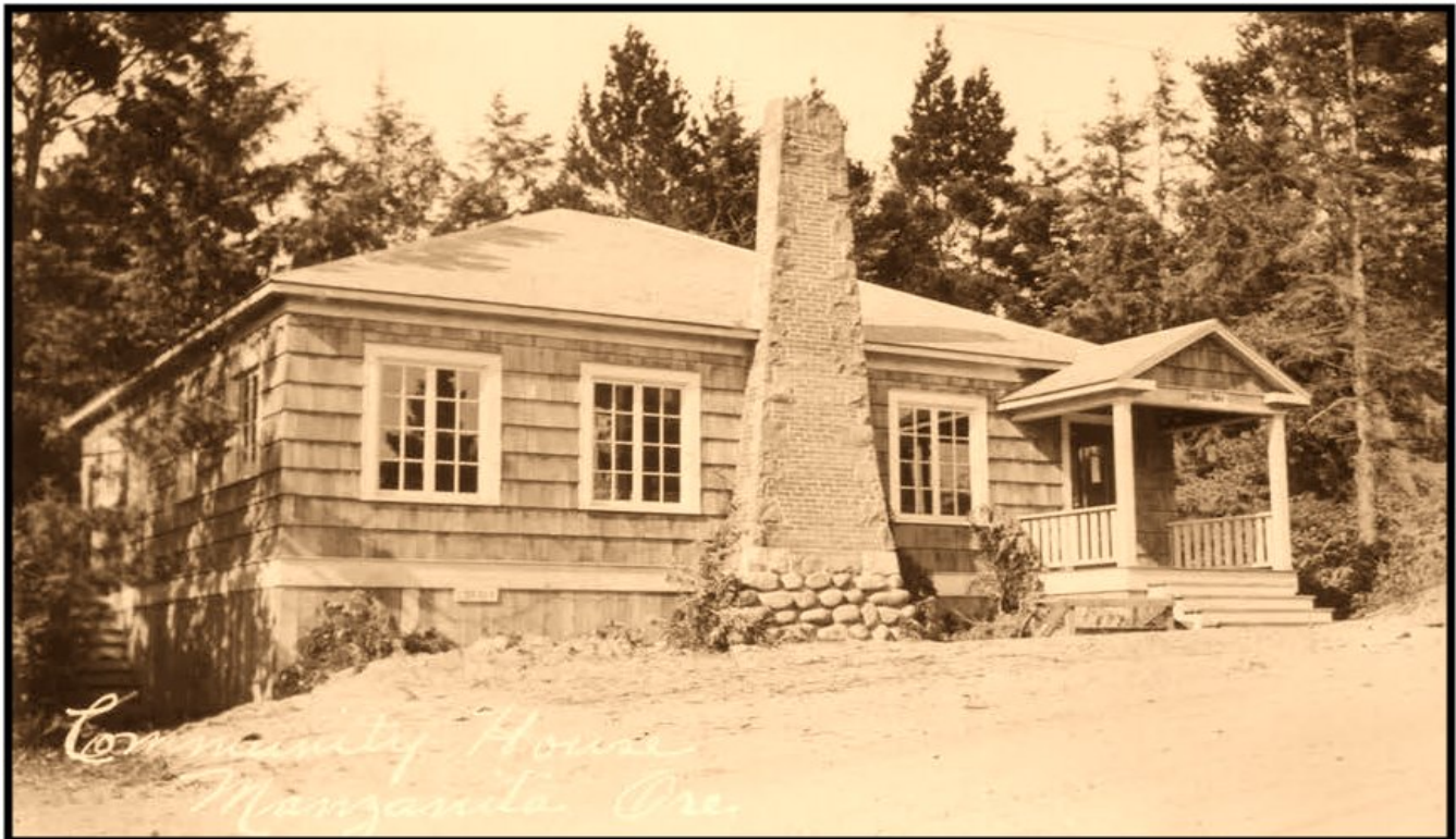
The Pine Grove Community House has served as the community center since 1933. Locals discussed civic issues there at monthly meetings before Manzanita got a city hall in the 1960s. Thousands of hearings, weddings, memorials, parties, concerts, and other events have taken place in the venue. In the 1980s, volunteers added a kitchen and developed the lower level. It is currently the home of the Nehalem Valley Historical Society.