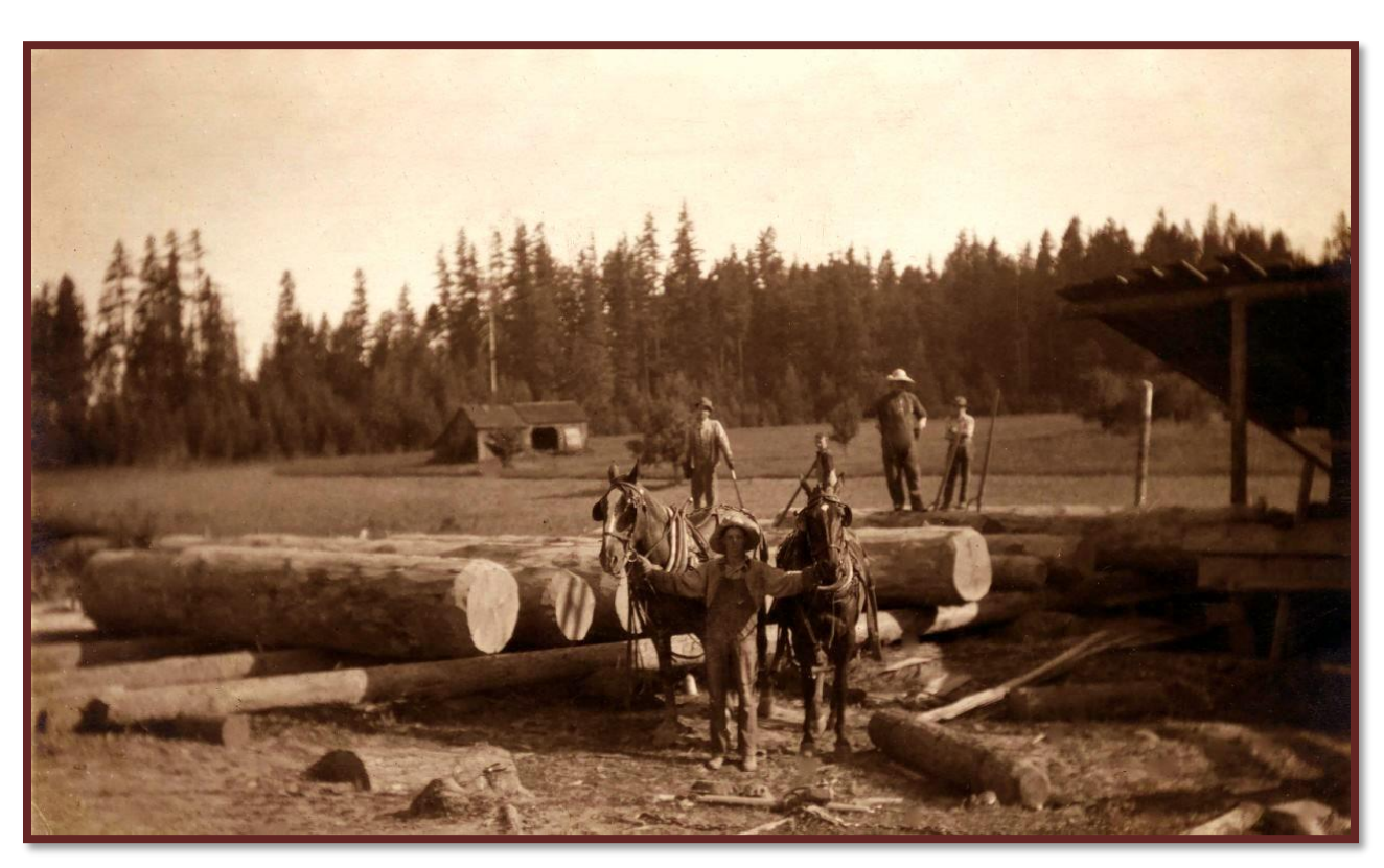
Buell's Sawmill and logs, looking northwest, ca. 1918.