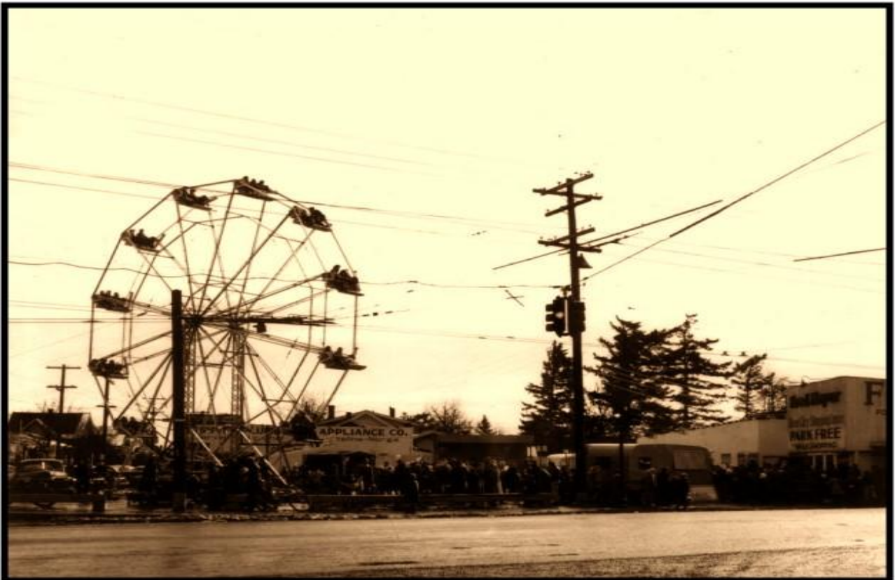
The new Rose City Fred Meyer opened February 14, 1949 with a Ferris wheel and a dog show.