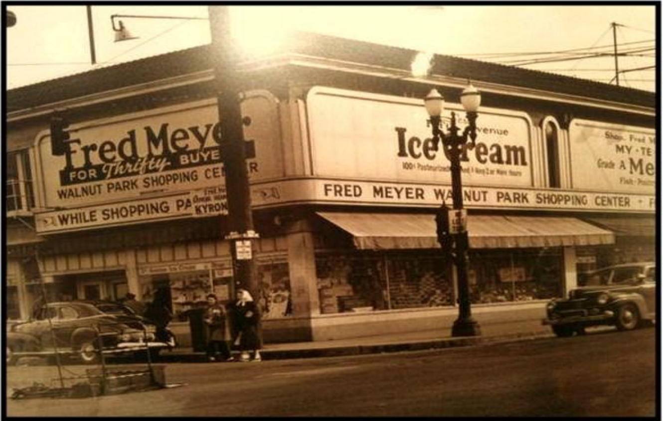
The Walnut Park store at Killingsworth and NE Union Avenue opened in November 1936.