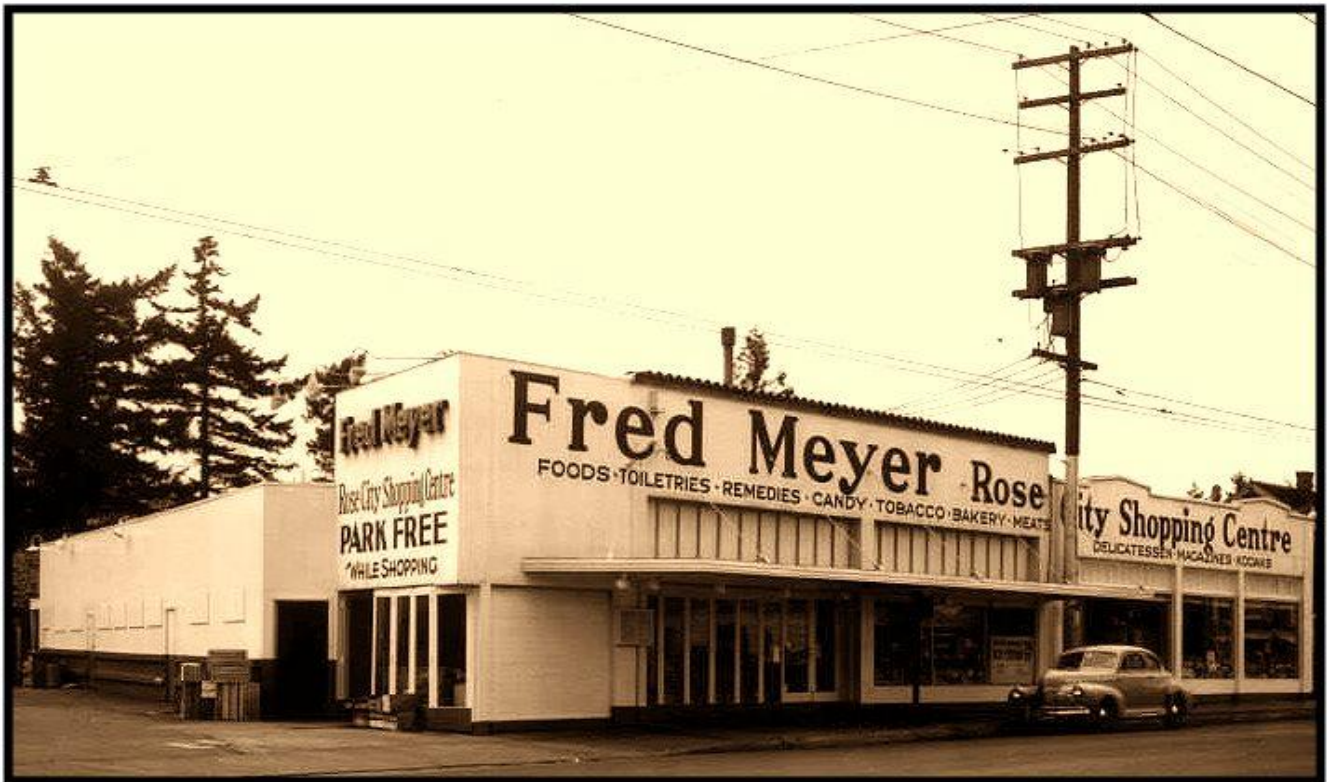
The Fred Meyer Rose City Shopping Centre at 72nd and NE Sandy Boulevard opened in the 1940's.