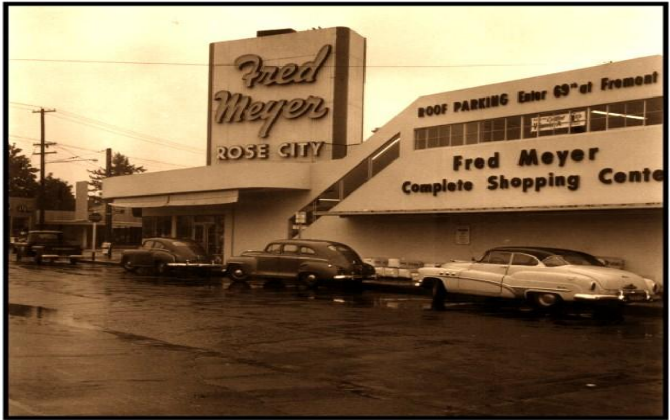
A new, larger Rose City Fred Meyer at 70th and NE Sandy Boulevard opened across the street in 1949.