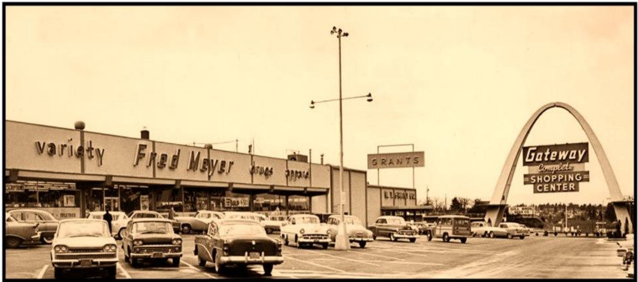
Gateway Fred Meyer in the 1950's.