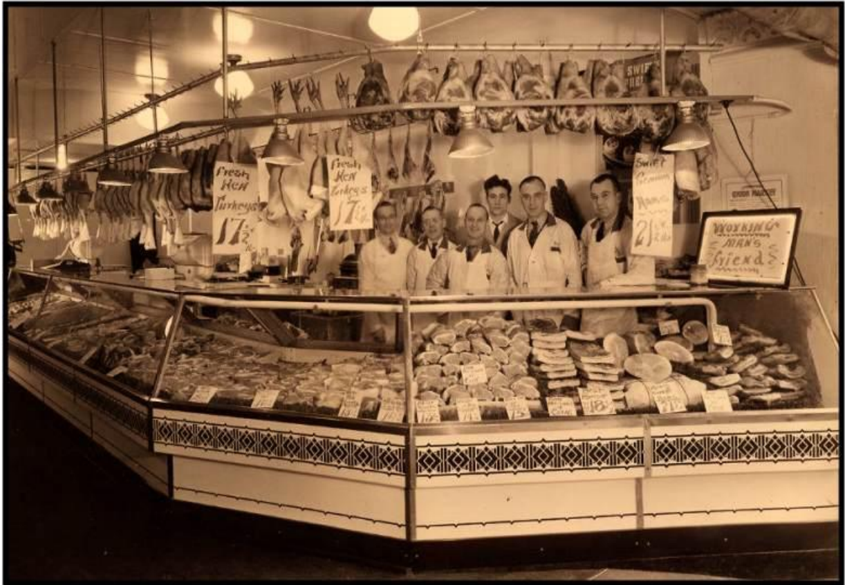
A view of the meat counter inside the Fred Meyer at 5th & Yamhill streets in 1940.