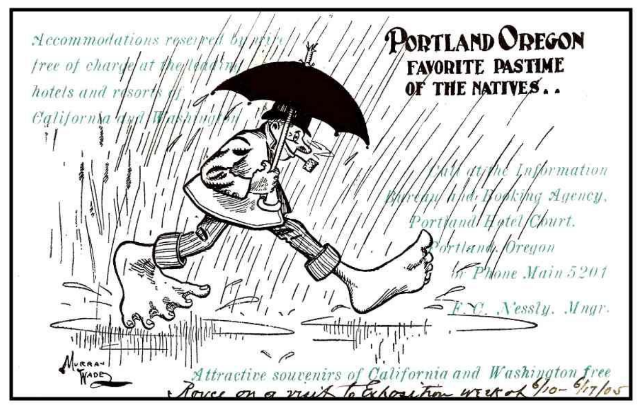
Some of Wade's designs were sold to merchants as being a way to advertise their business as shown in this earlier design repurposed for the Portland Hotel.