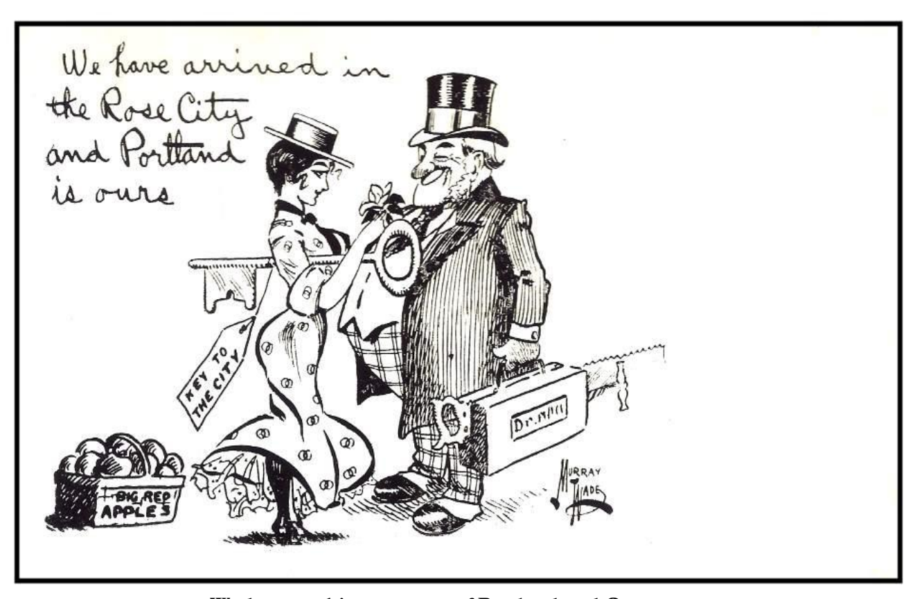
Wade was a big promoter of Portland and Oregon.