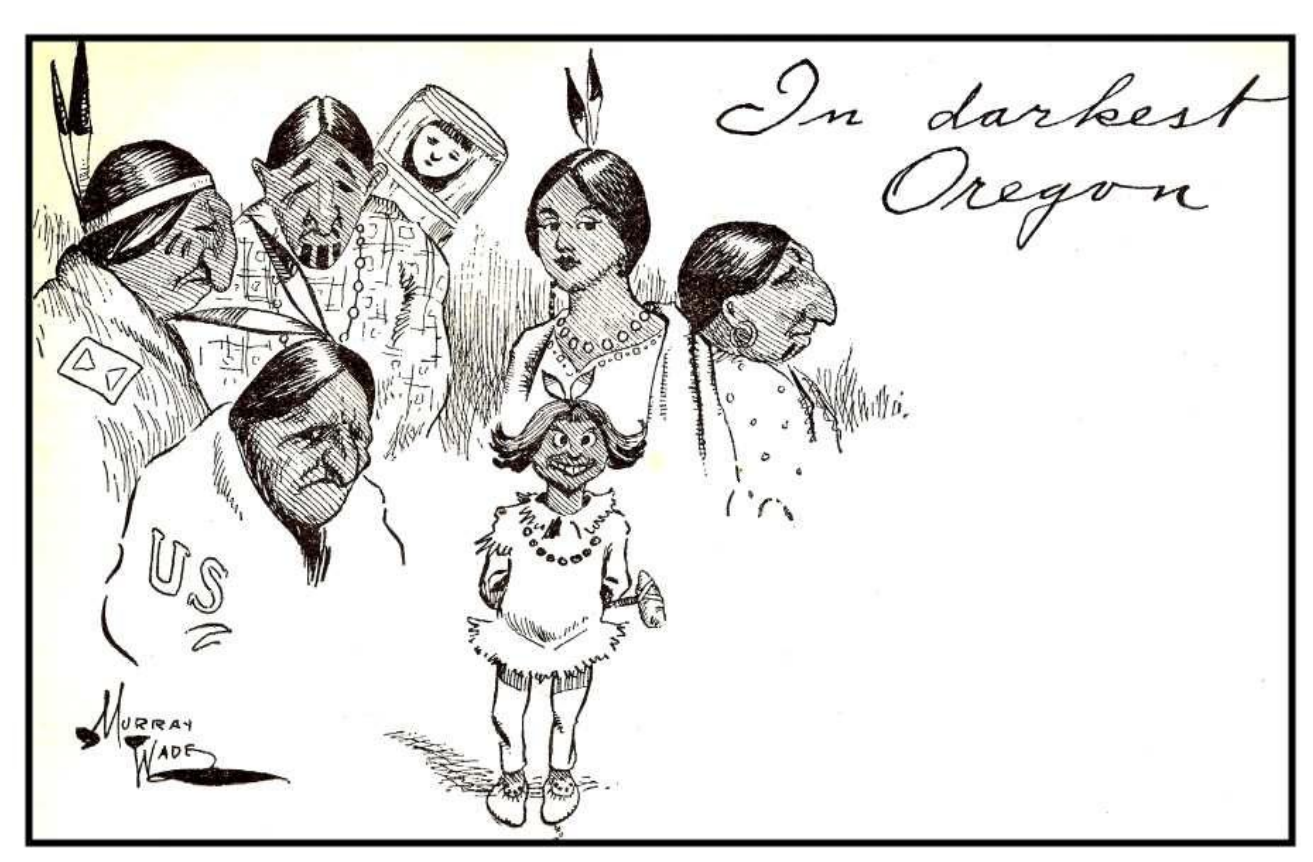
Wade drew sketches of Native Americans which are highly sought after.